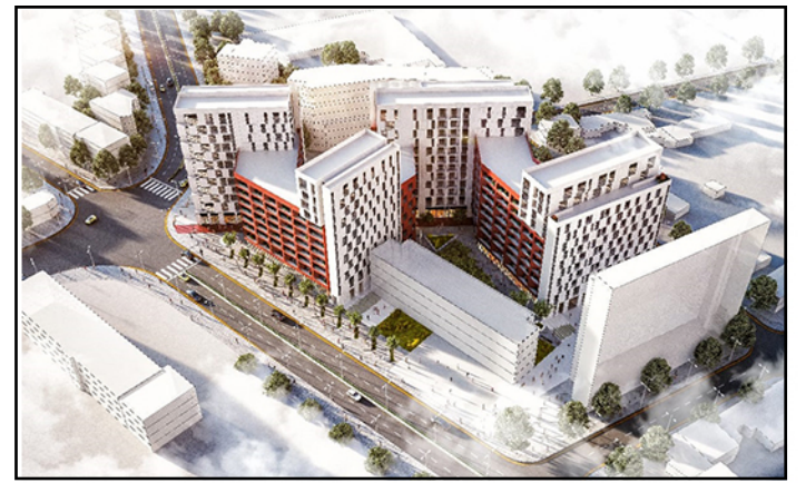
PERSPEKTIVA TE OBJEKTIT